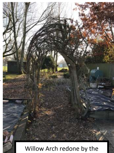
Willow Arch redone by the Horticultural Society

We are also planning some work soon on the KS1 playground to add to the space they have available. On Giving Tuesday we raised over £400 in donations from Parents which will help immensely. Hopefully this will all be ready in time for the warmer weather.