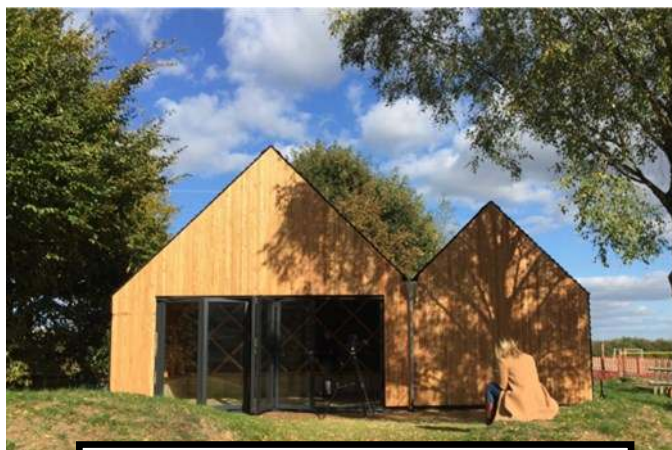
Front of the Music Room, showing the new timber cladding & bi-fold doors