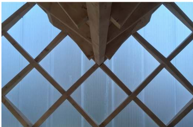
View of the rear wall from the inside, showing the translucent polycarbonate cladding

The only thing left to buy before Mrs. Insley can move in and start using the space is a screen, so she can hook up a laptop and show lyrics and music during her lessons. The other final thing that we'd really like to do as a part of the project is make some improvements to the KS1 playground, which is adjacent to the building. Quite a lot of soil was added to the grassy 'Dragon mound' next to the playground during the Phase 1 construction work; it's now a little too steep to play on and also has some flint near the surface of the soil which poses a danger to the children. We'd therefore like to hire a groundwork company to remove the mound altogether, creating a flat grassy area as an extension to the playground. We already have some funds from Giving Tuesdays earmarked for this, and are obtaining quotes at the moment. Hopefully we'll be able to carry this out in the coming months so that we can finally have an official opening ceremony in the summer term, and bury the Time Capsule that many of you contributed to.