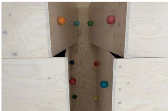
Coloured pull handles on the large storage drawers which will go under the benches