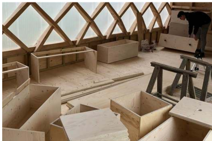
The built-in storage bench during installation